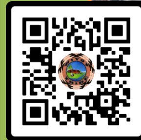
madaqilh / vadaqilh (“it stares” = lizard)