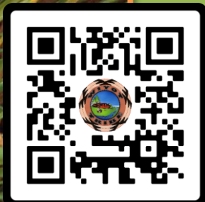
ha'rich / ha'ruch (snake)