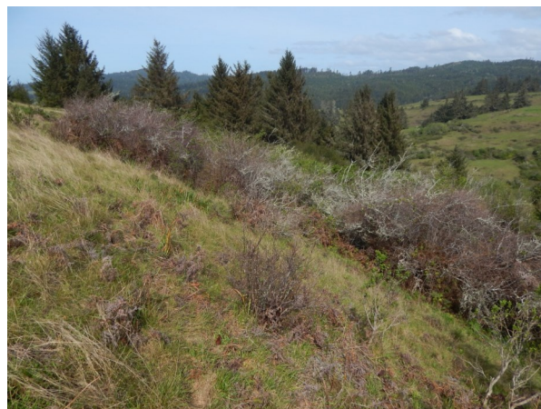
Relic hazelnut stand on Table Bluff

The Wiyot Tribe, who’s homeland occurs on the shores of Humboldt Bay and its’ tributaries, as well as the Eel and Mad River estuaries, hold a rich legacy of botanical stewardship and wild-foods cultivation. Anyone who has visited the unique land feature of Table Bluff, a low broad ridge that separates Humboldt Bay from the Eel River valley, can attest to the beauty of its expansive grasslands, prairie, and berry thickets that seem to stretch out into the infinity of the Pacific horizon. If you are driving out on Hook-ton Road from Highway 101 you will pass by dense shrublands as you switchback up the bluff, by the old Wiyot community of Indianola at Dandy Bill’s (not to be confused the Indianola between Arcata and Freshwater). Dandy Bill was a well-known early Wiyot leader who helped give many tribal citizens’ a welcomed return to Table Bluff after they had been displaced and forced to move to surrounding reservations, like Hoopa or Smith River.