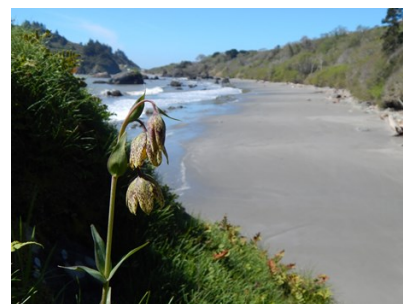
Indian potato ( Fritillaria affinis ) growing on sea stack in Trinidad