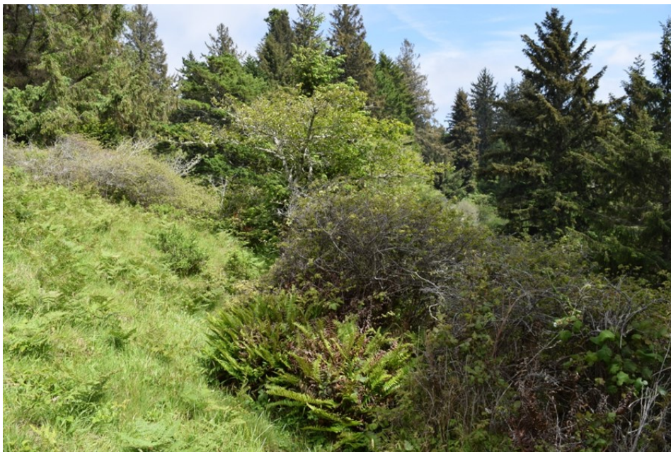
Remnant hazelnut ( Corylus cornuta ssp. californica ) scrub patch, Humboldt Hill