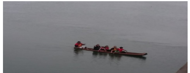
Youth enjoying a ride in a Traditional Redwood canoe.

in over 150 years we had Redwood Dugouts on the Wiyot (Eel River). We had a great turn out with some of our elders and a lot of youth from our tribe and the Bear River Youth Program. They had a great time participating in taking the dugouts on the river as well as paddling and steering them on their river. I would love to see more of these special Cultural activities revived, and enjoyed by our youth. A special Thank you also to Red Deer Consulting for bringing out these Great Ancestors, to be enjoyed by everyone. This Department looks forward to continued work with Red Deer Consulting on future projects. I look forward to hearing any of your ideas on what you wish your Cultural Department to focus on in the future.