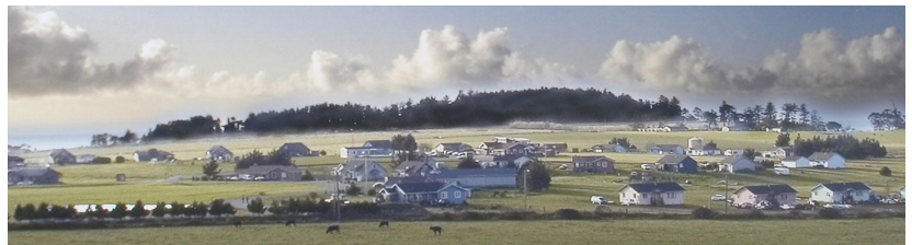
Table Bluff Reservation