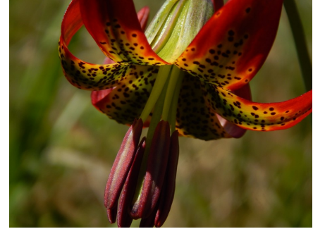
Western lily ( Lilium occidentale ) on Table Bluff

This baseline botanical mapping data will be a great asset in helping the Tribe to prioritize populations of cultural interest for preservation and continued sustainable harvest for use in traditional basket making or food production, for example.