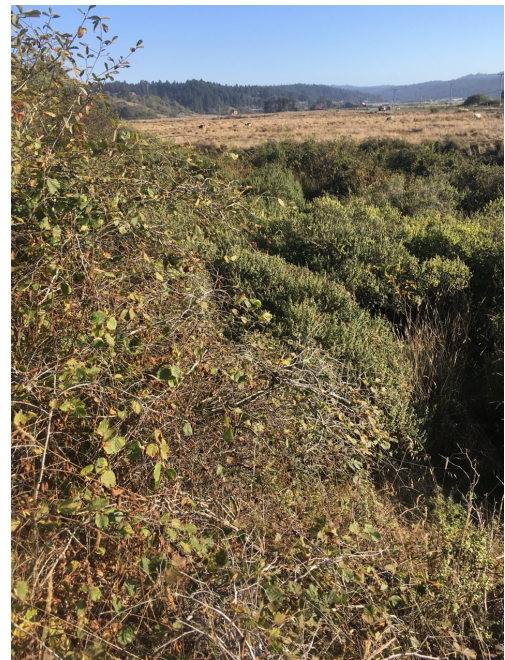
Photo 2. Remnant patch of hazelnut scrub along the Elk River estuary, Pine Hill, Eureka.

Check out the conferences website at: https://conference.cnps.org/