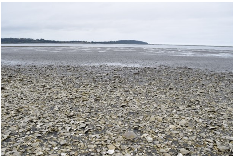
Table Bluff (Rraloughu) as viewed from Ratplh clam bed, near Fields Landing.

Table Bluff is an 88 acre jewel on the North Coast that serves as an eco-cultural landscape for the Wiyot people and provides ecological services to both Wiyot residents on the Reservation as well as those who live off the Reservation and want to re-connect with traditional cultural practices like berry picking. Ninety two percent of survey of respondents want areas protected on TBR from development and roads and set aside for eco-cultural uses and water quality. Other interests include a great desire to restore native plant communities and wild-foods like berries and Indian potatoes, as well as access to herbal medicinal and traditional cultural plants like wormwood ( Artemisia douglasiana ) hazelnut ( Corylus cornuta ssp. californica ), and vine tea ( Clinopodium douglasii ). How should we manage and use our large grassland now that cattle grazing is no longer permitted? Do we want a trail from TBR down to the bay for clamming? Should TBR have chickens and provide eggs to the elder and youth food programs? Should we grow more strawberries? These land uses and more are future visions for TBR. Come on out to Wiyot Days and VOICE YOUR VISION!