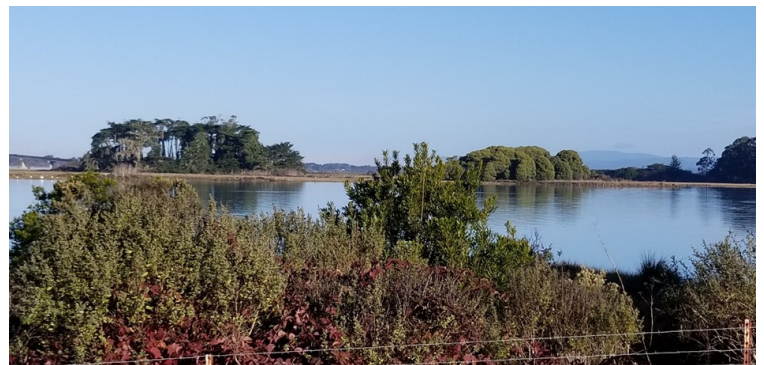
At the height of the King Tide on December 14, 2020, the water level was at approximately 8.67 feet at the village of Tuluwat (not shown here).

If you would like to skip to the part of the event where Cheryl and Marnie talk, the timestamp is 1:26:21.