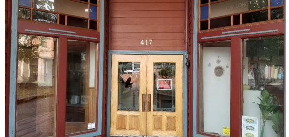
East entrance from the Gazebo side of the build-

Our building is located at 417 Second Street, Eureka. Watch our monthly Newsletter for ongoing updates! And please remember to send in your survey.