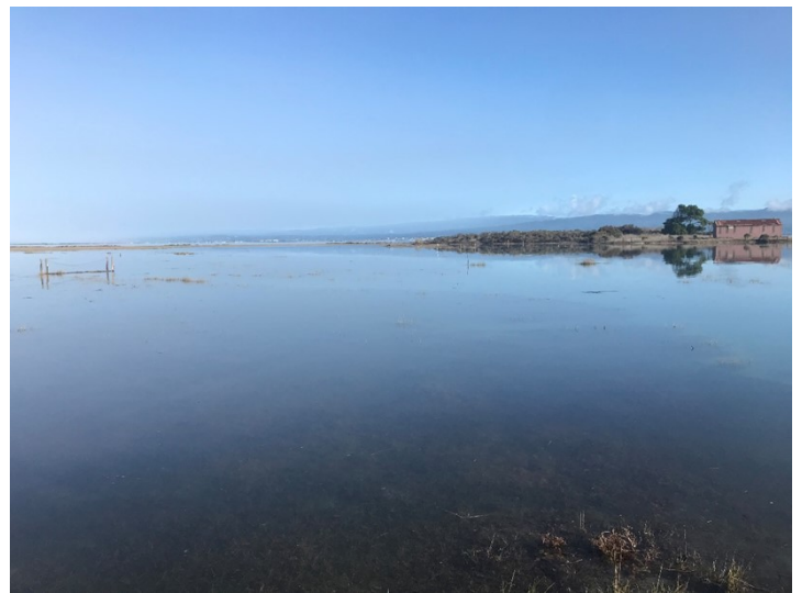
King Tide (8.7 feet), Tuluwat, December 14, 2020