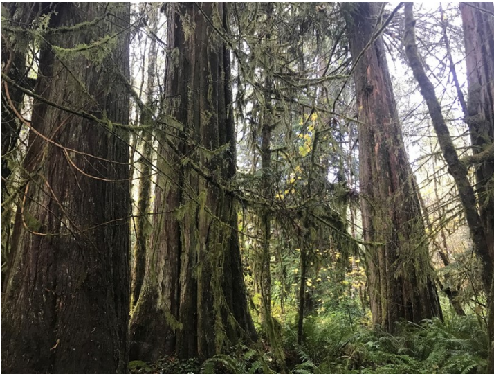
Old-growth western red cedar grove, Goukdi'n Forest, November 2020

If you would like to participate in the WNRD’s climate resilience research, please also contact the WNRD at adam@wiyot.us. The next and final King Tide of the winter will be January 11-12, 2021. Get out and safely see the future of sea level rise in real time! In these inward times of winter and Covid-19 the WNRD want to encourage everyone to escape safely into nature and we wish you all the best in 2021.