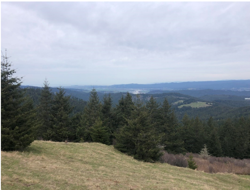
Viewing the Lower Eel from Bear River Ridge, on a bike ride on March 18.

Back in the fall of 2022, the WNRD had submitted a proposal with Stillwater Sciences and Cal Poly Humboldt to NOAA’s Transformational Habitat Restoration and Coastal Resilience funding opportunity. We received word in mid-March that our proposal was not selected for funding. Although this is unfortunate, we are not discouraged from pursuing future funding opportunities. All salmon, steelhead, and lamprey must pass through this degraded area as both adults and juveniles. This area is becoming a primary focus for restoration, monitoring, and further understanding of the hydrogeologic functions. WNRD plans to remain involved.