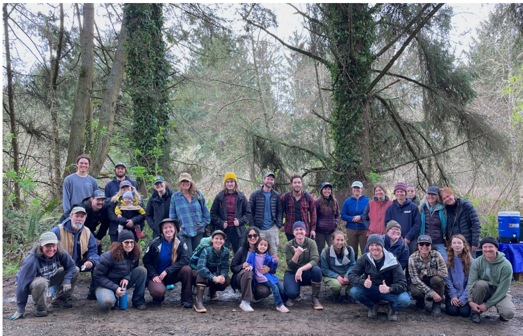
Figure 1. An impressive group of WAVE Volunteers at the Mouralherwaqh ivy pull! March 11, 2023.