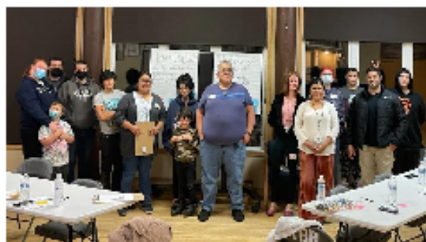
Tsek Houdaqh Family Night Participants

would like to see implemented at the Tsek Houdaqh Youth Program and how they would like to see the program involved in the community.