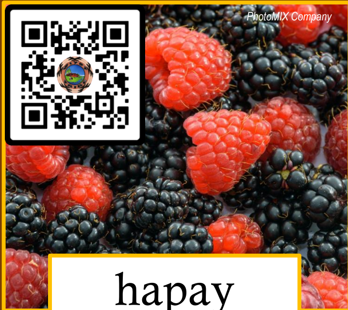
hapay (fruit, berries)