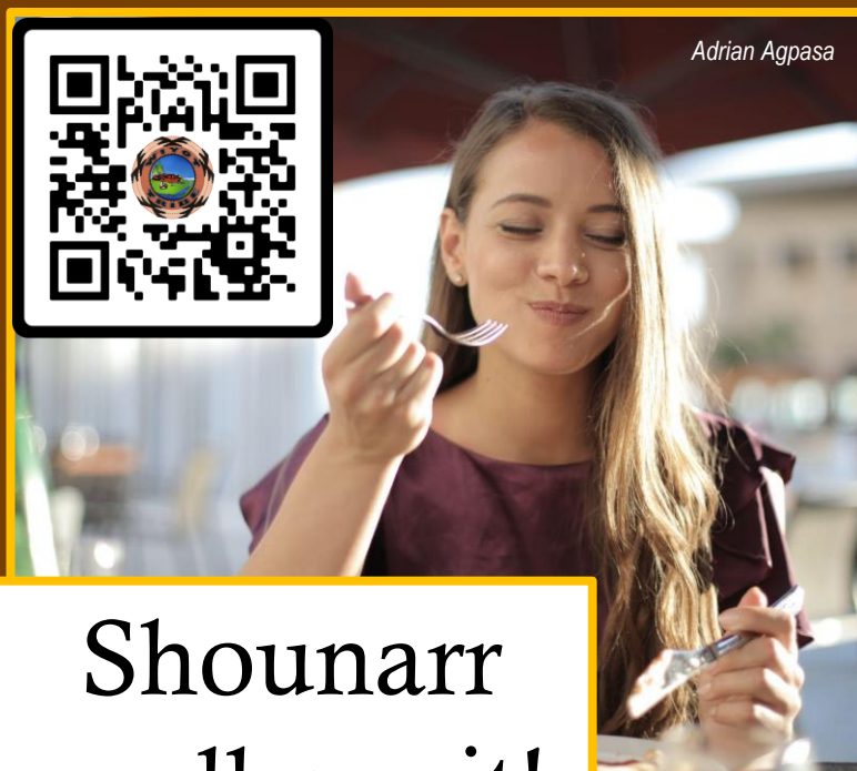
Shounarr gaplhuyit! (Let's eat!)